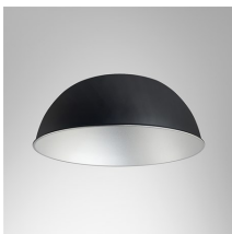
Black aluminium reflector